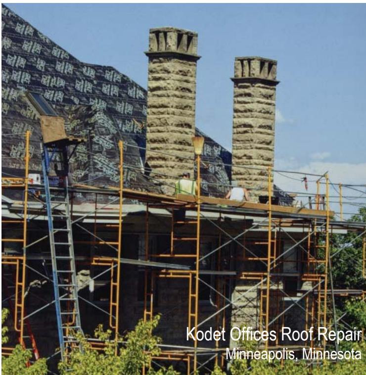
Kodet Offices Roof Repair Minneapolis, Minnesota

This project recognizes the importance of Modern design. The congregation is preserving this period of architecture while meeting the needs of the people who are using the building today.