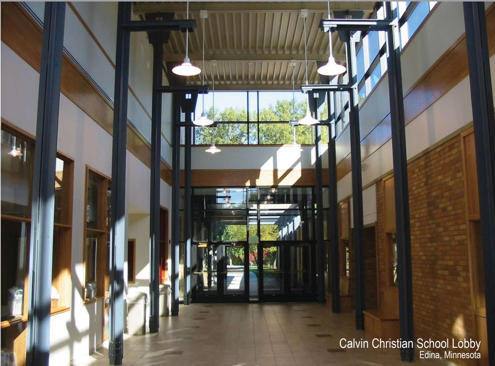
Calvin Christian School Lobby Edina, Minnesota