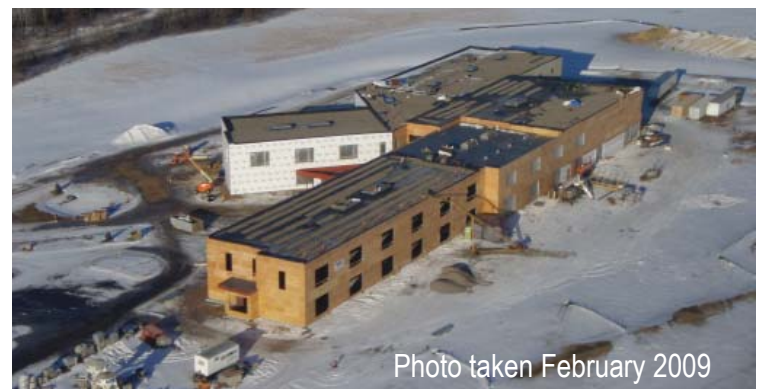
Photo taken February 2009

Respecting the environment, Kodet designed the new St. Croix Prep to meet sustainable, energy-efficient design criteria. Key features and benefits include high indoor air quality, a plentiful number of large windows for daylighting, and the use of low-maintenance brick and pre-finished metal cladding materials.